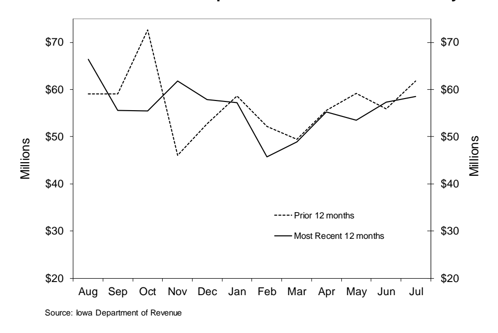
Figure 1. Iowa Monthly Fuel Tax Collections Less Refunds and Credits: Most Recent 12 Months Compared to Prior 12 Months for July 2017

Collections and gallon amounts contained in this report are from the Supplier/Terminal or "Rack" level, not the retail level. Further blending of products may occur along the fuel distribution chain. This is the case for most E85 (gasoline blended with 70 to 85 percent ethanol) gallons, so the gallons reported for this fuel type are far below the number of retail gallons sold in lowa.